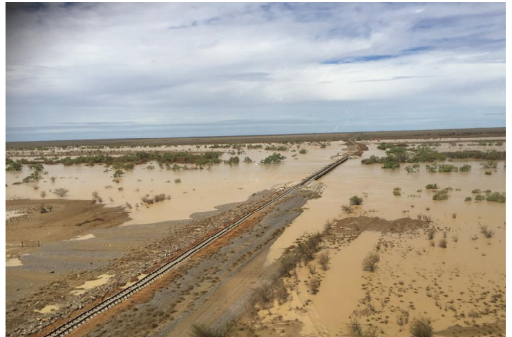
Flooding at Julia Creek, in the shire of McKinlay.

By way of background to newer readers of IGEM Connect , my Office over recent years has initiated a program of capability reviews across selected disaster districts in Queensland to assess the ability of groups within districts to deliver effective disaster management outcomes, measured against the Standard for Disaster Management in Queensland. Previous reviews have focussed on Townsville and Mackay and a pilot in Warwick.